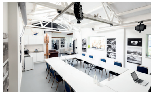
Preserved in time: Jack Powell, left, carries sails up the steps outside the former sail loft, now The Pin Mill Studio and The Sunshine Store. Above, The Pin Mill Studio today, available for courses, company away days and photographic shoots

is also available to hire as a course venue or for companies looking for away day facilities for up to 16 people including the option of a lovely lunch. The building used to be a sail loft – and on the walls is an enlarged photo of Jack Powell carrying a sail up the very steps outside the Studio. Jack’s sister, Miss Powell, was the landlady of The Alma pub next door, mentioned in Ransome’s book We Didn’t Mean To Go To Sea .